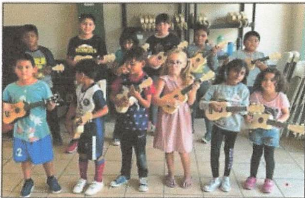
Kids club of La Cruz learning Ukulele donated and built by La Cruz expats.