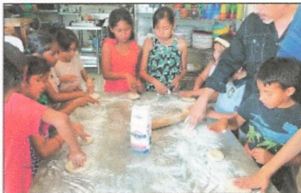
Refuge of Hope students learn to make tortillas.

With this service, clients buy 30 days of rental car service at a